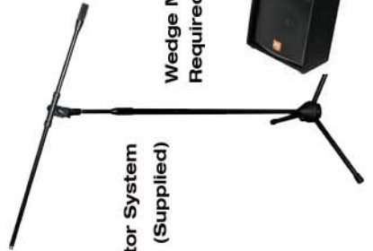
Wedge Monitor Required