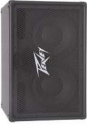
Direct Line Requires DIRECT BOX