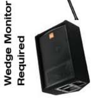
Wedge Monitor Required