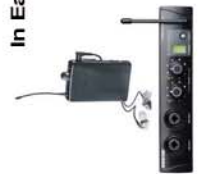
In Ear Monitor System (Supplied)