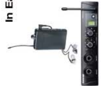
In Ear Monitor System (Supplied)