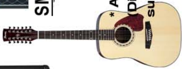
* Acoustic Guitar Direct Line with supplied direct box)